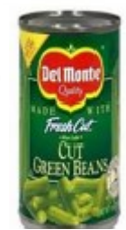
Can Green Beans 20 oz.