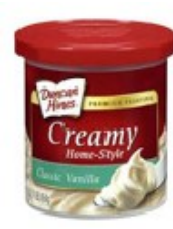
Can of Icing