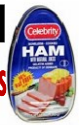
Canned Ham 3 lb