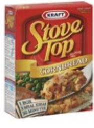
Box of Stuffing